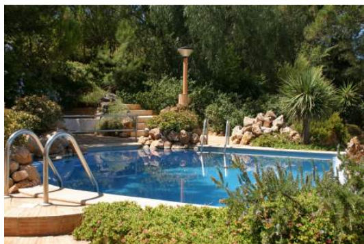
Pool & Garden