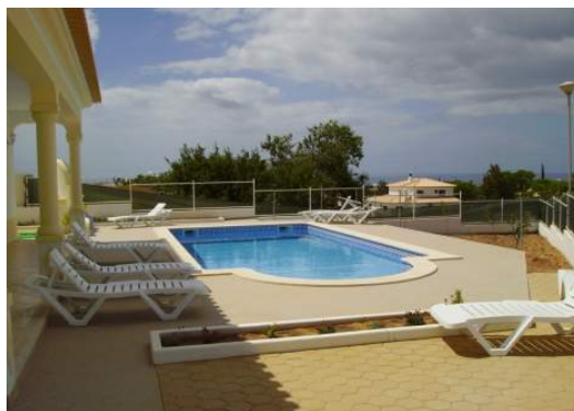
Terrace with Pool