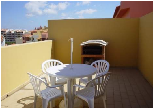
Terrace with BBQ