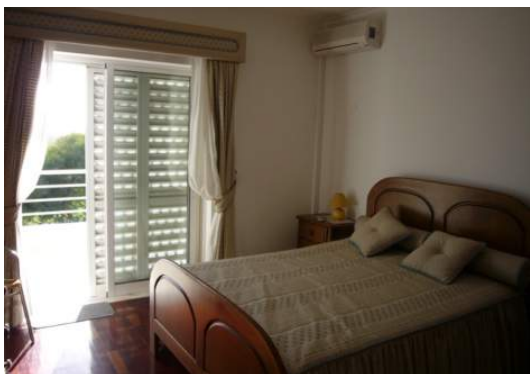
Bedroom 1 (15.6m2)