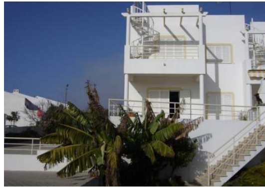
Semi detached townhouse