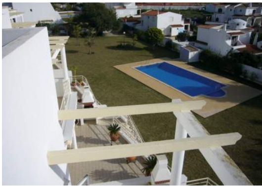
Pleasant complex with pool