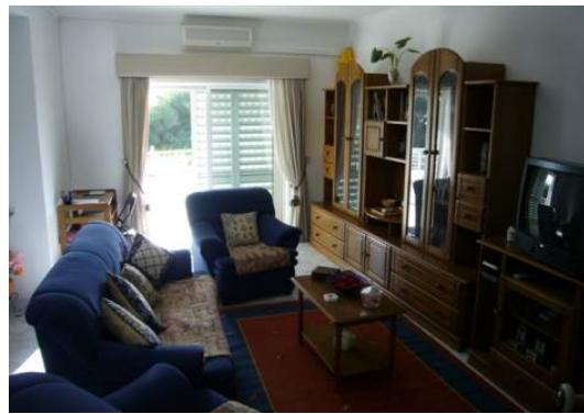
Living room (27.6m2)