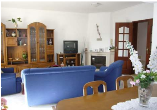
Living room (27.6m2)