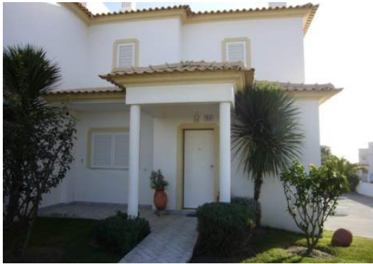
Semi detached townhouse