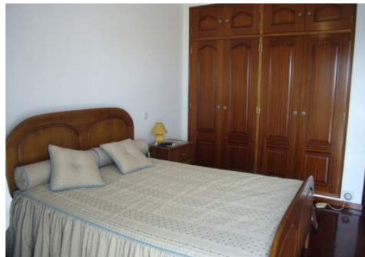
Bedroom 1 (15.6m2)