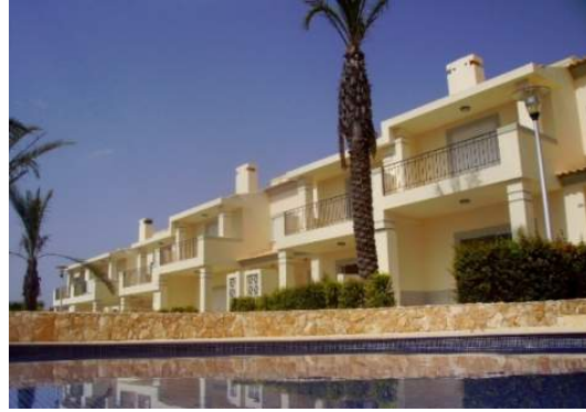
Quality complex with pool