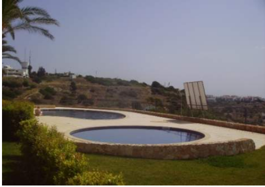
Quality complex with pool