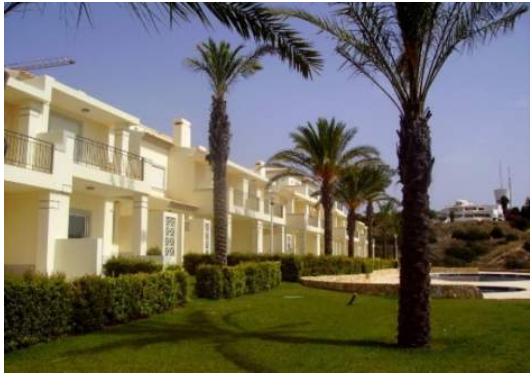
Quality complex with pool