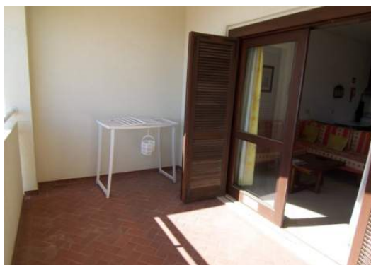
View from balcony