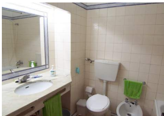
View from balcony