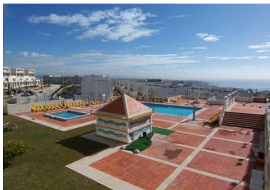
Living room (25m2)