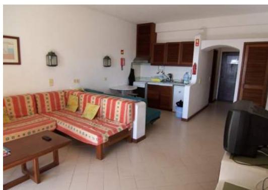
Bathroom 1 (4m2)