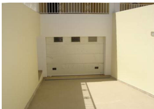
Access to garage