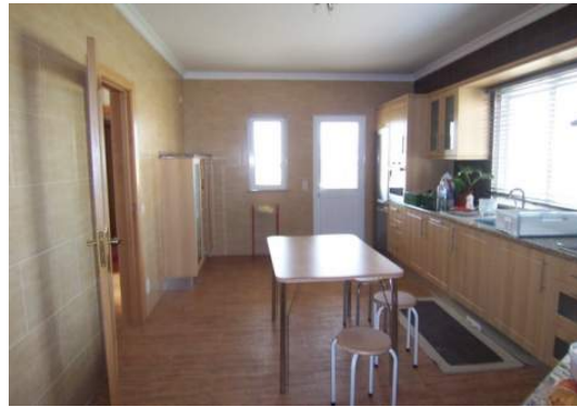
Kitchen (19.25m 2 )