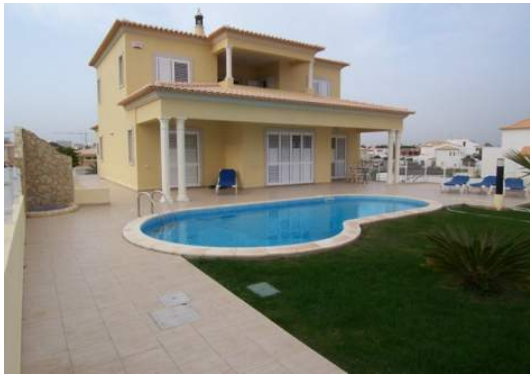
4 Bedroom villa