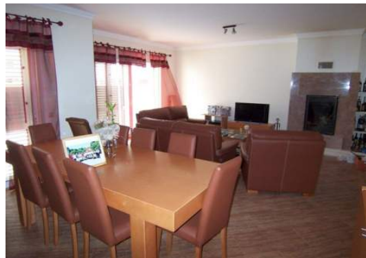
Living room (38m 2 )