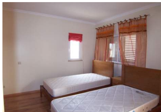
En-suite bedroom 3