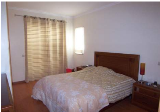
En-suite bedroom 2 (23.4m 2 )