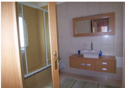
En-suite bathroom 3 (5.7m 2 )