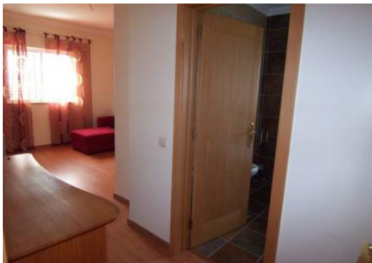
En-suite bedroom 1 (20.79m 2 )