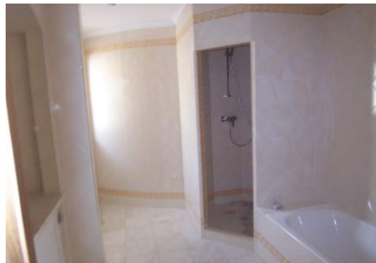
En suite bathroom 1 (9m2)