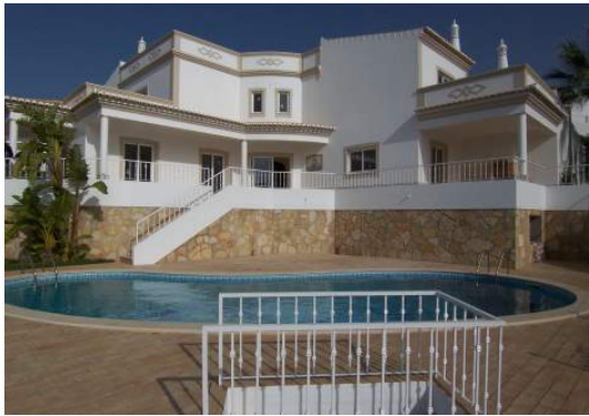
4 Bedroom villa