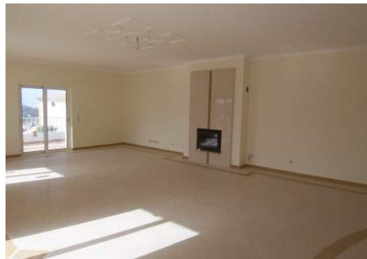
Living room (44.74m2)