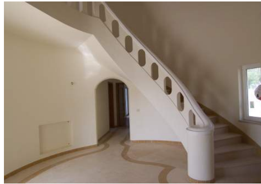
Entrance Hall (19.62m2)