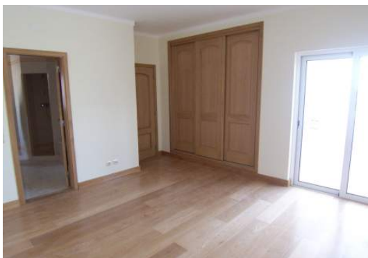
En suite bedroom