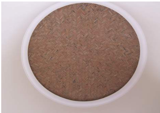
Ceiling Entrance hall