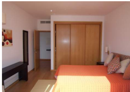
Bedroom 1 (15.35m2)