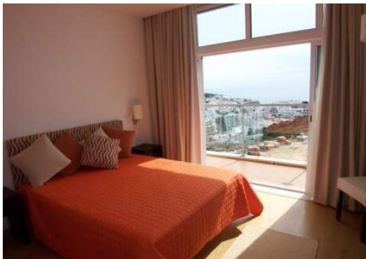
Bedroom 1 (15.35m2)