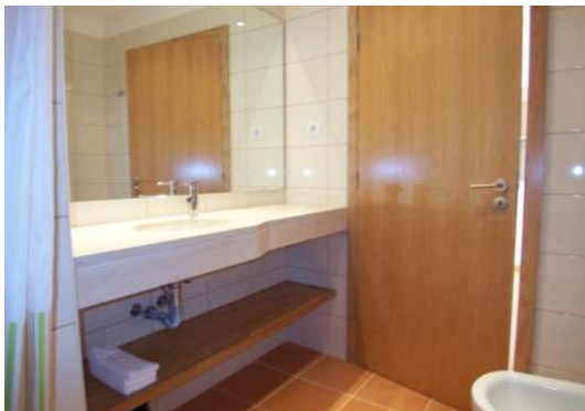
Bathroom 1 (4.1m2)