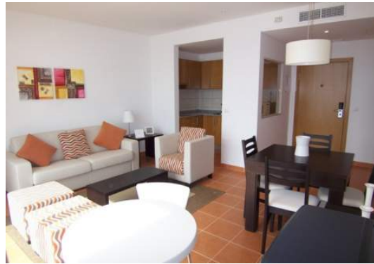
Living room (20.5m2)