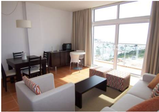
Living room (20.5m2)