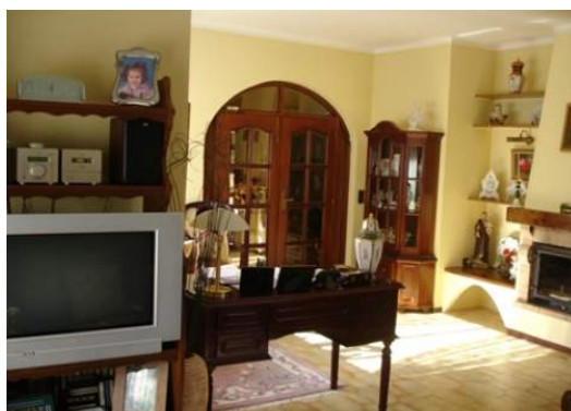
Living room from a diferent angle